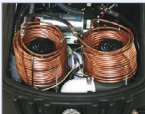
Patented Perfect Heat® technology