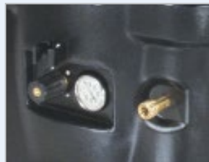
Front mounted pressure gauge on 500 p.s.i. models and recessed brass connector.