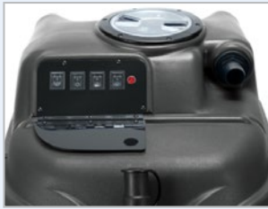
Independent motors, pump and heater switches.