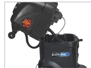
Clam-shell design allows easy access to pump and heater.