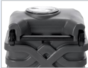
Handle mounted transport wheels for easy loading and unloading.